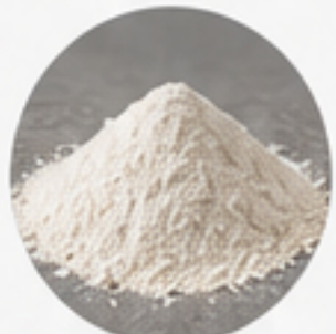
FOOD GRADE POWDER